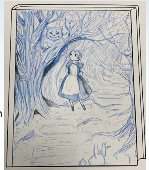
Mya's winning book cover design