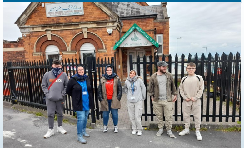
Tallow Hill Mosque, Worcester

Students have to study two religions and we felt that it was appropriate to choose Islam due to misconceptions this has with some people. Therefore, we visited Tallow Hill Mosque in Worcester and in September we will be visiting Birmingham Central Mosque.