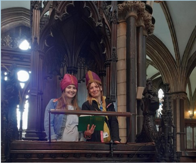
Everyone was given the opportunity to be 'bishop' and sit on the Bishop's Throne!

Following the visit to the Abbey, we went to Worcester Cathedral and were given a guided tour. Students were fascinated by the scale of the building and its amazing carvings and tombs.